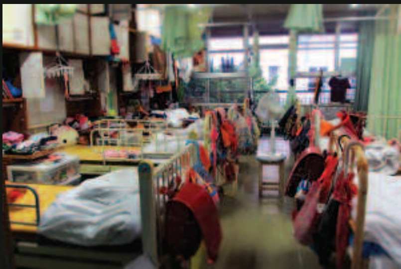
Beds in sleeping quarters for elementary school girls at a child care institution in Iwate prefecture. Eight girls share a room, and the space on their own bed is the only place children are allowed some privacy. Even such privacy is guaranteed only by a simple curtain surrounding each bed, August 2012.

Human Rights Watch recommends that Japan undertake urgent reforms to transition its alternative care system away from reliance on institutions toward greater use of foster care and adoption where children can live in family-like settings. Japan should also reform its Child Welfare Act to support more child rights-friendly processes and ensure adequate resources and political commitment to support children in alternative care.