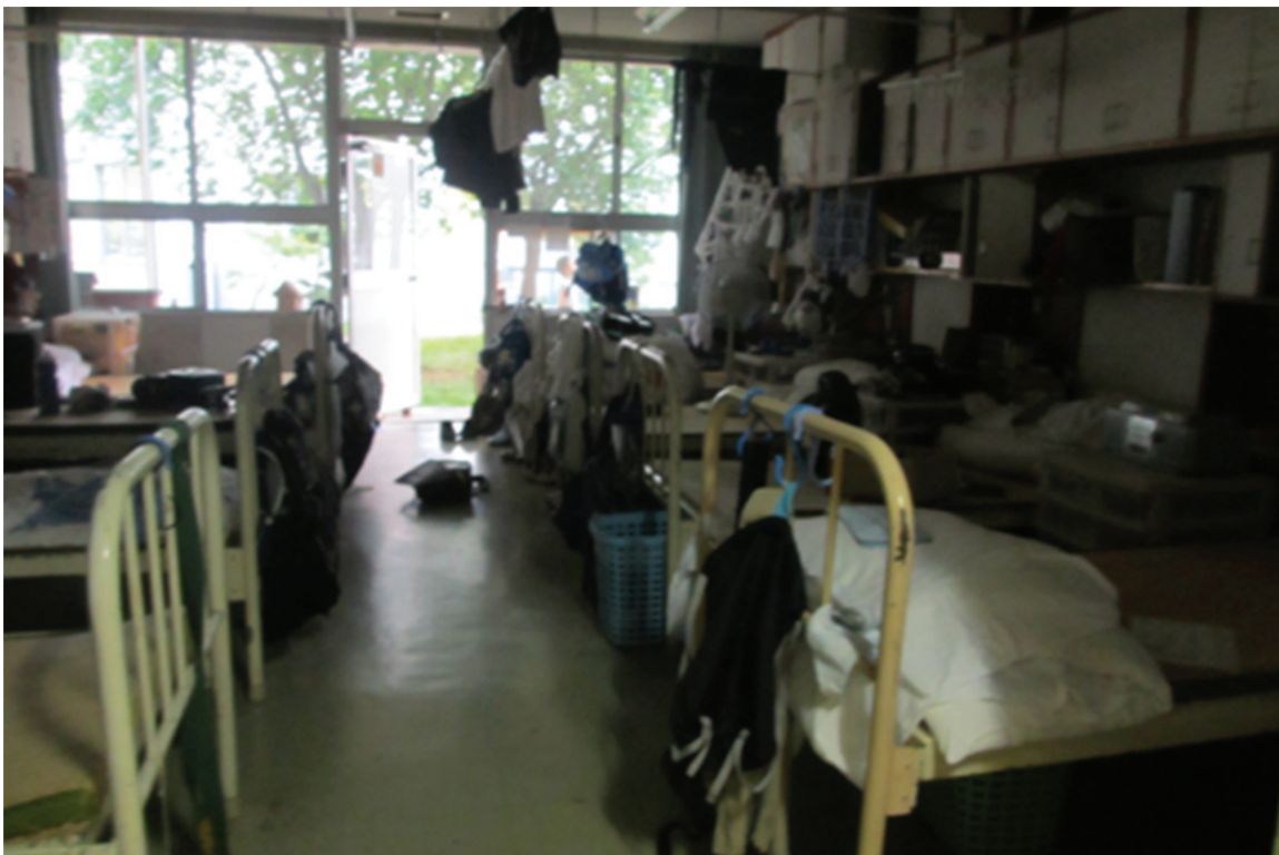
Sleeping quarters for boys at a child care institution in Iwate prefecture. Children's' rooms often resemble medical wards filled with hospital beds, August 2012.