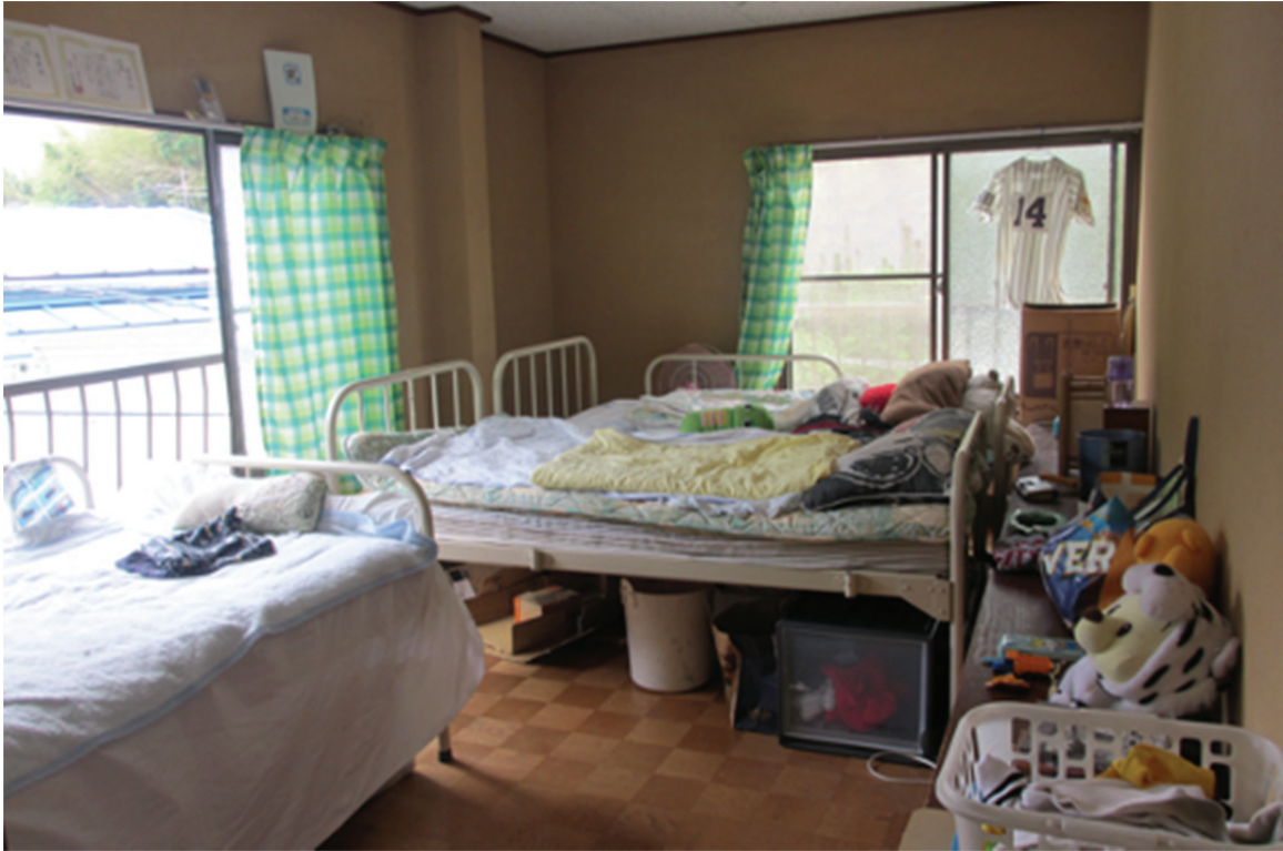
Sleeping quarters for children at a child care institution in the Kansai region. Even teenagers have to share a room with others, without any private space for themselves, June 2012.