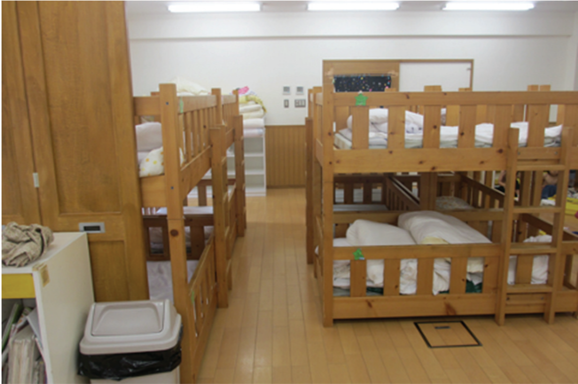
Beds for children in kindergarten at a child care institution in the Kansai region. The beds are supplemented by a small playing space in the same room, June 2012.