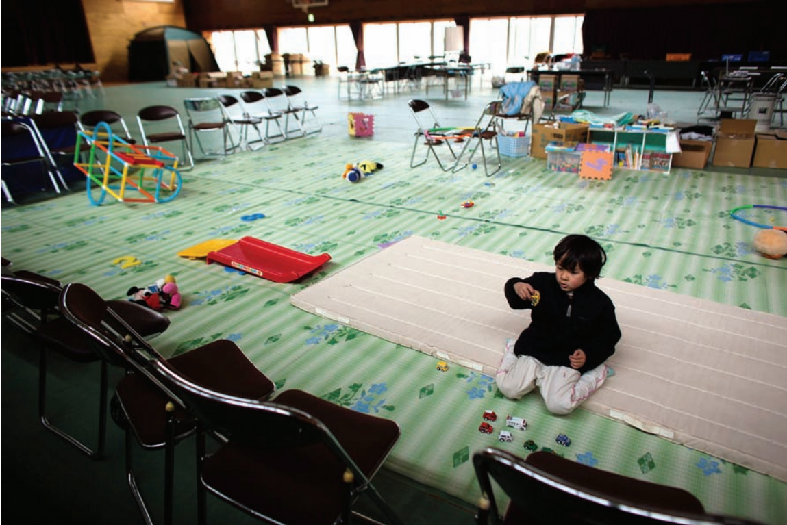
A child plays inside an evacuation center in Kamaishi in Iwate prefecture, March 2011.