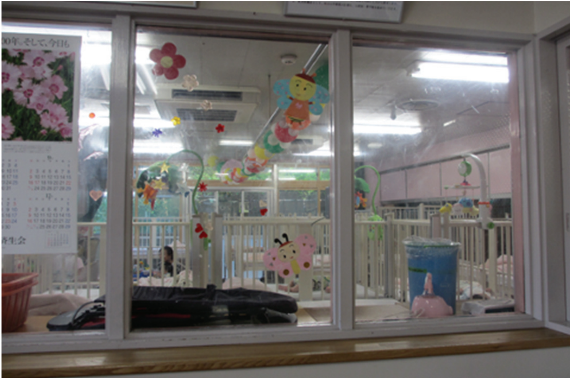
Baby beds lined up side by side at an infant care institution in Tokyo, where newborns and infants up to age two are placed in two bedrooms with a capacity of 35 children each, August 2012.

(1,722 children) were admitted to infant care institutions. 69 Almost half of all municipalities and government ordinance-designated cities did not have a single case of foster parent placement for infants under one year old in 2011. 70 In 2011, 2,963 children were living in infant care institutions. 71