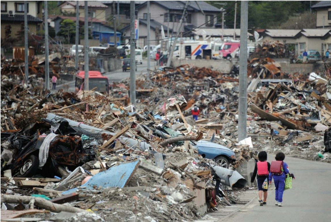
Elementary school students walk beside the rubble after school in the tsunami-devastated town of Otsuchi, Iwate prefecture, May 2011.

The earthquake of March 11, 2011, was the strongest ever recorded in Japan, with a magnitude of 9.0 on the Richter scale. The severity of the combined damage from the earthquake and resulting tsunami crippled nuclear power plants and inflicted unprecedented damage on the Tohoku region of northeast Japan. The disaster resulted in 15,884 deaths, 2,633 missing persons (now presumed dead), 127,302 completely destroyed houses, 272,849 half destroyed houses, 748,777 partially destroyed houses, and 58,421 destroyed non-house buildings. 324